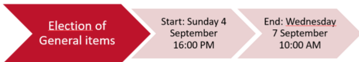
FIG GENERAL ASSEMBLY SESSION 2 11 September 2022 13:00 – 15:30 in Warsaw Poland